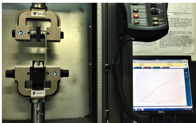
Fig. 3. Instron machine and RTC clamp

The Instron machine, model 5966, with a load cell of 10 kN, was used in the laboratory of composites and adhesives (LADES) of CEFET/RJ. This machine needed to be adapted with a Restrained Top Constraint (RTC) clamp for anchoring the specimens and performing the pull-out test (Fig. 3). In addition to assisting in fixing the block of the test piece, the clamp has a sufficient opening for the passage of the fiber. The use of the RTC